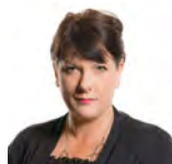
Rhianon Passmore AM Welsh Labour Islwyn