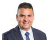
Neil McEvoy AM Plaid Cymru South Wales Central