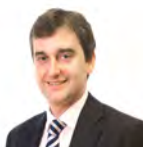
Nick Ramsay AM (Chair) Welsh Conservative Monmouth