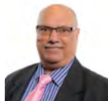
Mohammad Asghar AM Welsh Conservative South Wales East