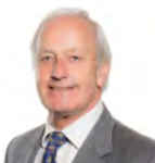
Neil Hamilton AM UKIP Wales Mid and West Wales