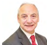
Mike Hedges AM Welsh Labour Swansea East