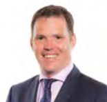
Lee Waters AM Welsh Labour Llanelli