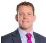
Rhun ap Iorwerth MS Plaid Cymru