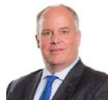
Andrew RT Davies MS Welsh Conservatives