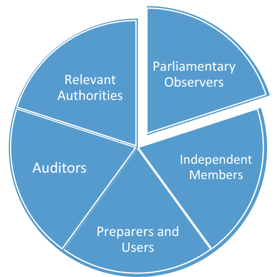
The pie chart above details the breakdown of FRAB membership into core groups.

Consisting of three members nominated by finance directors of UK government departments, one member nominated by the national statistician, one member nominated by the Ministry of Housing Communities and Local Government and one member nominated by CIPFA/LASAAC¹ from their own membership.