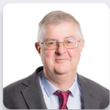
Mark Drakeford MS Welsh Labour