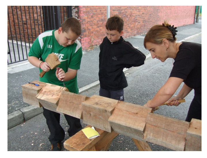
Young people learn new skills by helping to carve totems which were then installed as a gateway to their street in Manchester