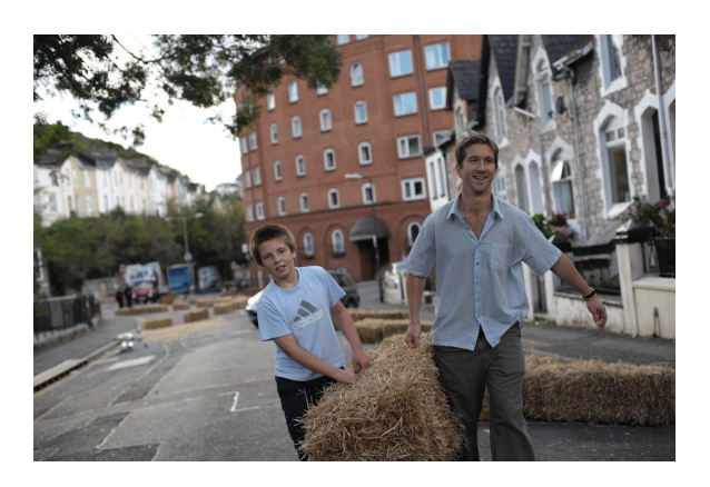
A local young person helps the DIY Street designer to set out a proposed design using straw bales during a trial in Torquay