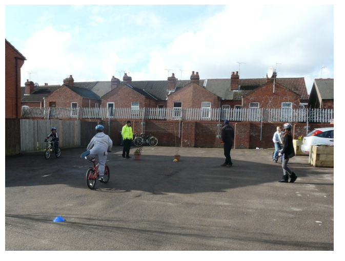
Young people in residents use their street space to learn cycle skills at an event in Coventry.