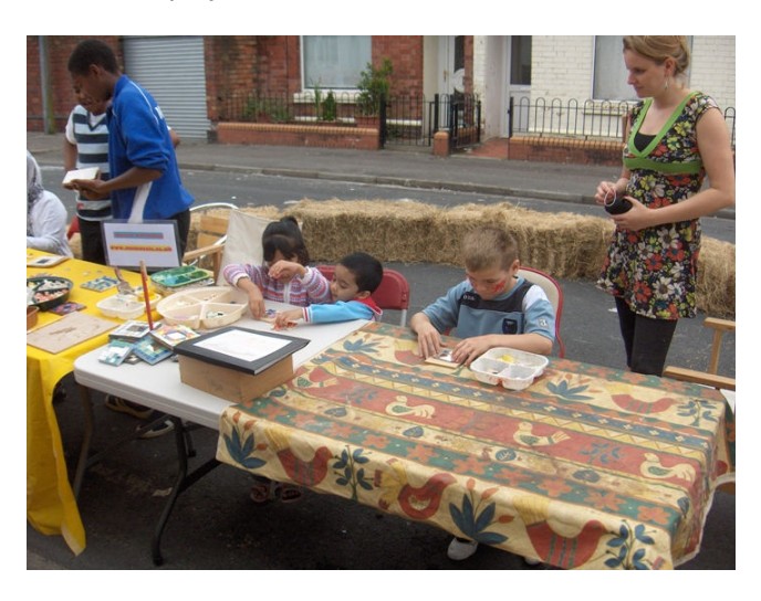
Children help design mosaics to be laid into the new features in their street in Cardiff