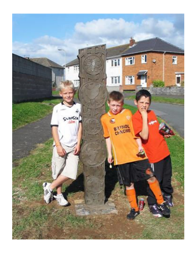
Young residents of Heol Degwm, Bridgend, pose proudly with artwork in their street which they helped to design