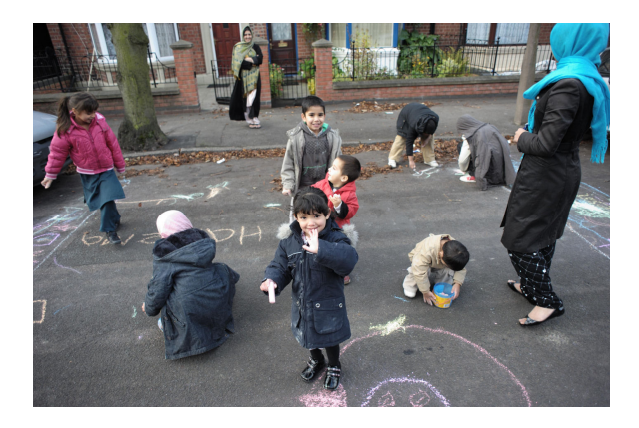
Children customise the proposed location of a raised table during a street trial in Sheffield