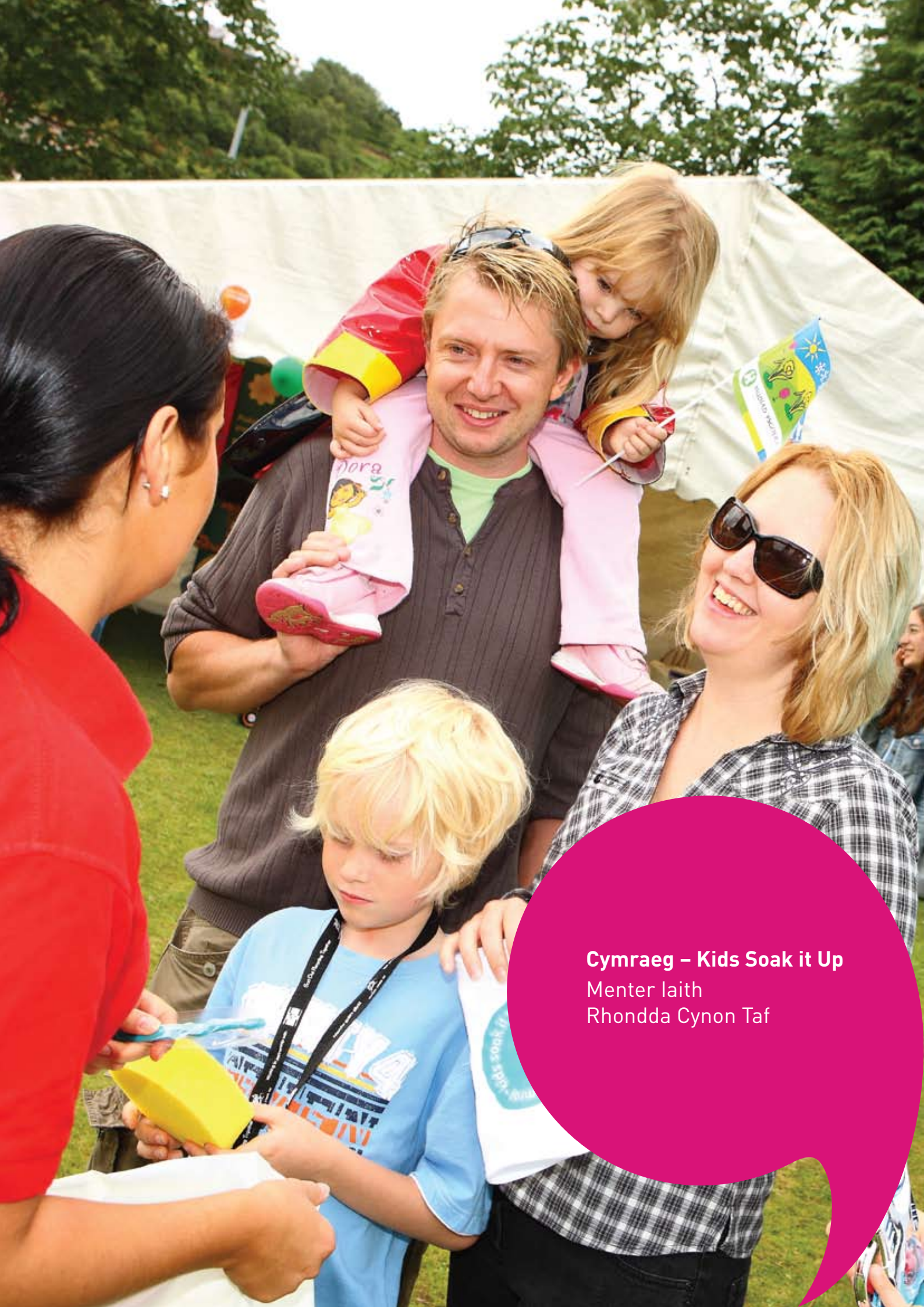
Cymraeg – Kids Soak it Up Menter Iaith Rhondda Cynon Taf