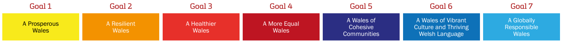
Table 1 : The Welsh Government’s contribution to the well-being goals