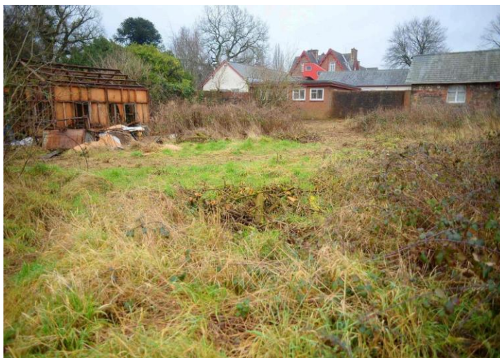
THEN: The neglected garden in 2015

Originally the kitchen garden attached to Grange House - on the other side of the garden to the new hospital - when it was a private manor, the garden was later used for therapeutic horticulture for residents when Llanfrechfa Grange became a Learning Disabilities hospital in the 1950s. All manner of fruit and vegetables were grown in well-maintained plots, but when patients were resettled into the community in the 1990s, the garden became unused and fell derelict.