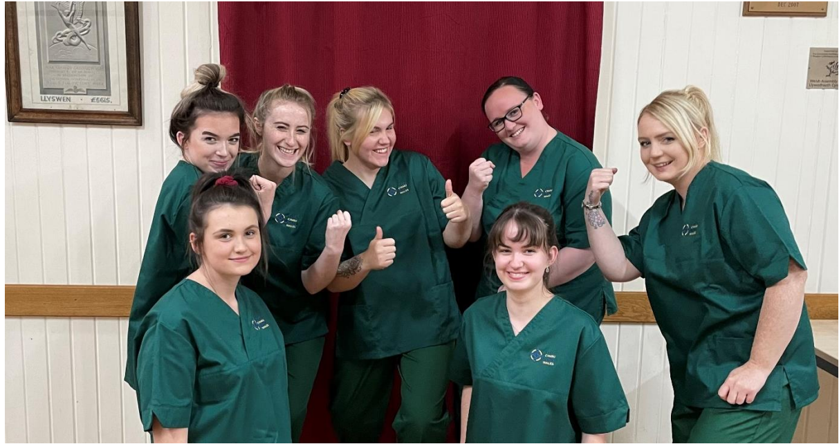
Current cohort of Health Care Support Worker Apprentices